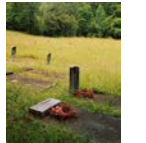
Wards Chapel Cemetery Where Alice Walker's Parents and Ancestors Are Buried, Eatonton, Georgia, 2020